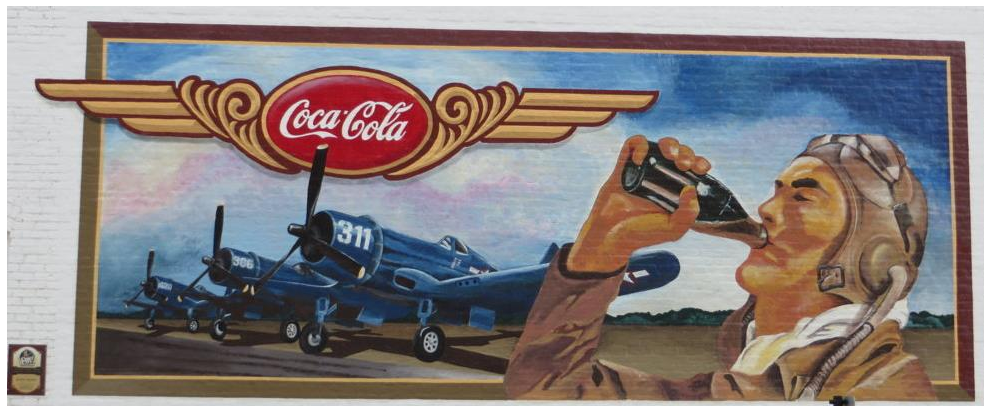
Mural RT. 66 Pontiac, IL